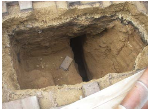
Coal Mining Related Fissures