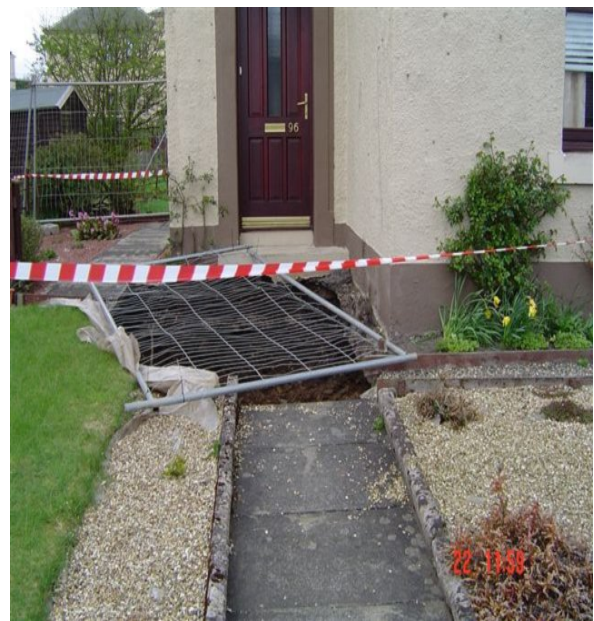
Mine Entries: Open Countryside and within Existing Developed Areas