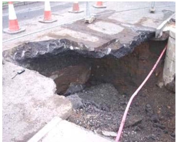
The Collapse of Shallow Coal Mining Workings