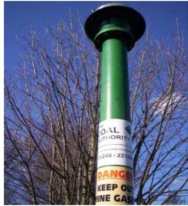
Mine Gas Vents