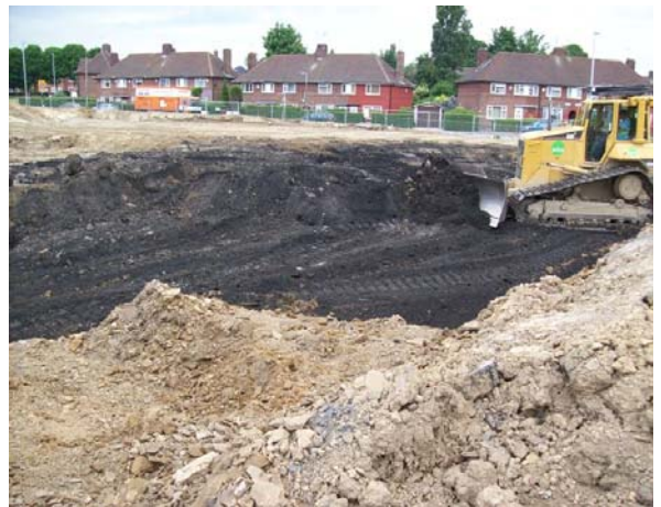
Coal close to the surface being extracted as part of ground works: prevents sterilisation and effective method of remediating unstable ground caused by former coal workings