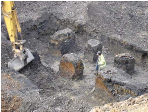
Pillars of coal being extracted as part of ground works: prevents sterilisation and effective method of remediating unstable ground caused by former coal workings